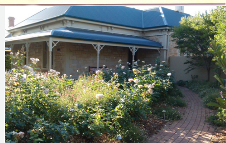
Gloucester St, Prospect, 1925 & 2010 Four Generations Beautifully restored Story will appear in Prospect in Photos