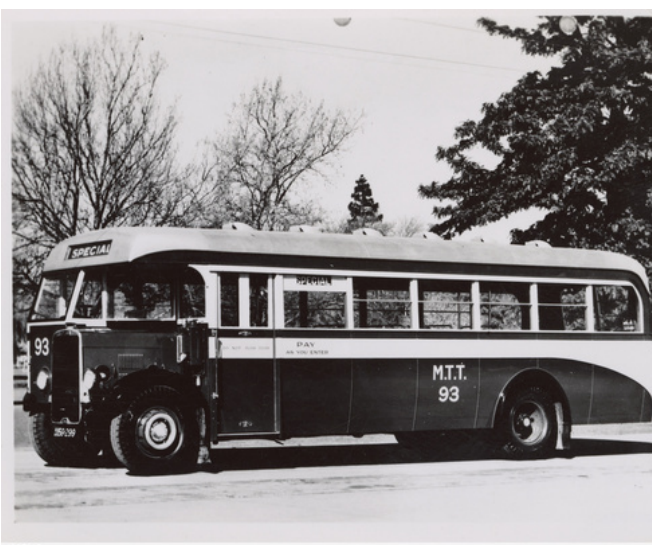
MTT Bus 1940

My belief that the bus terminated in Howard Street springs from the fact that a great aunt lived at number 57 and I seem to remember a bus along there in the 1950s. I have vague feeling that it may have terminated at the shops near Collingrove Avenue. I think I must have read the last rather than remembering it. Early newspaper reports confirm the terminus was once near Collingrove Avenue. However The Advertiser 22.11.1941 reports