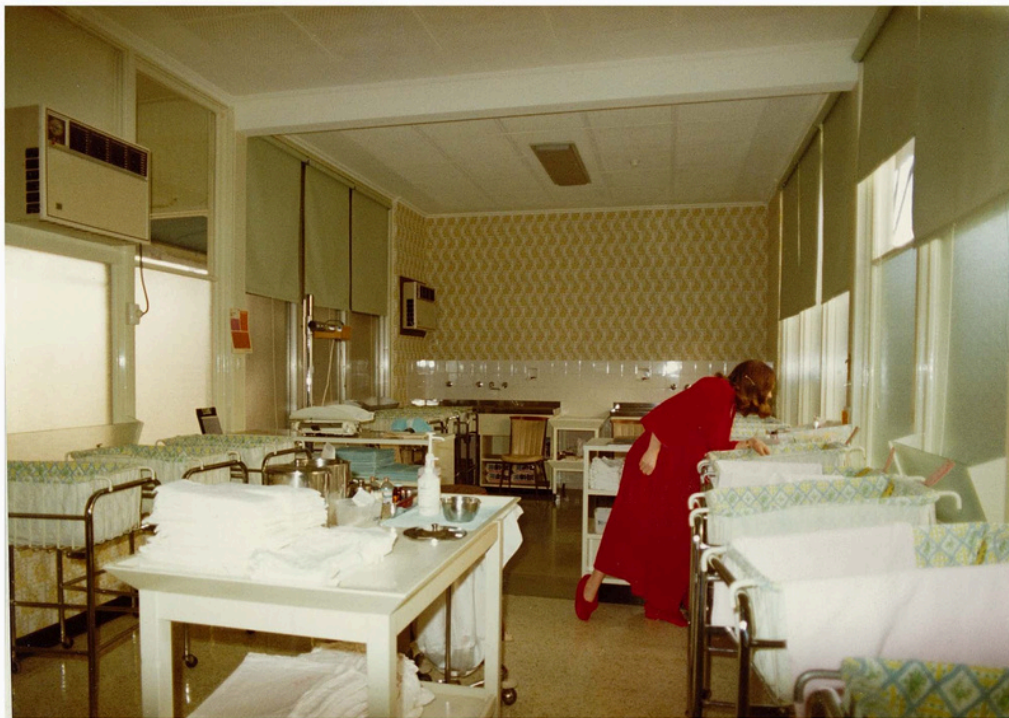
Northern Community Hospital Maternity Ward